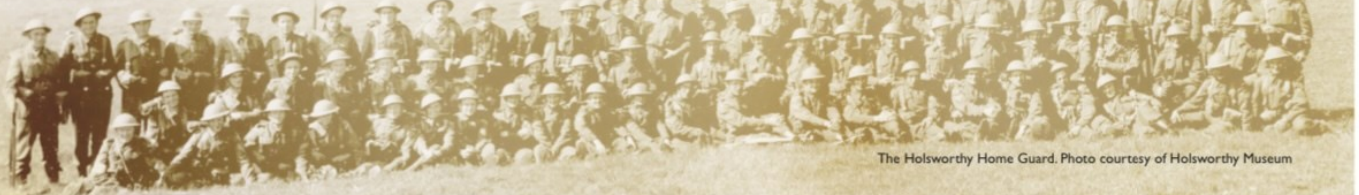
The Holsworthy Home Guard.

For vendor and participant forms, please request via email /messenger or through the website. Thankyou.