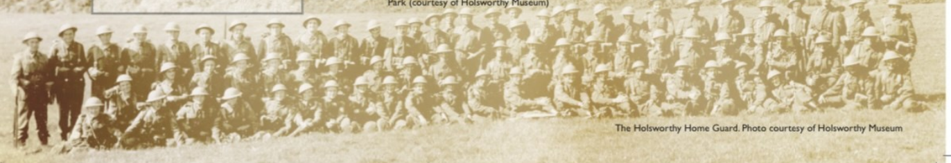
The Holsworthy Home Guard.