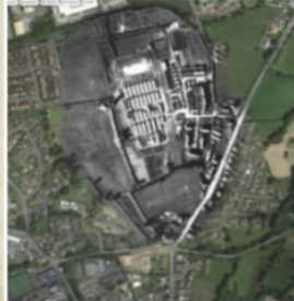
Camp 42 PoW camp overlaid on Stanhope Park

Holsworthy has a rich war history filled with tales of courage, humour and intrigue