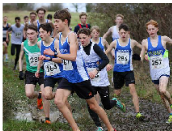
2023-24 LEAGUE PROGRAMME

FULL DETAILS AND TO ENTER ON LINE GO TO: www.northdevonxcleague.weebly.com